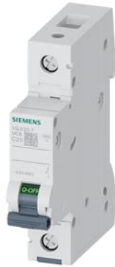
Miniature circuit breaker 230/400 V 6kA, 1-pole, C, 20 A